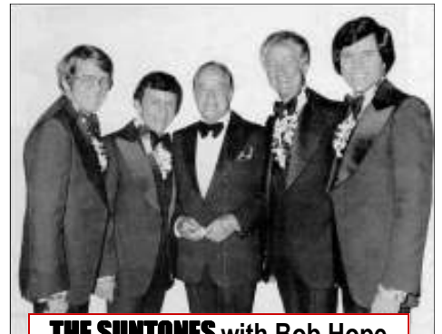
THE SUNTONES with Bob Hope