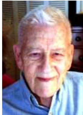
(3) Toosday Toons Chiz Bell Mid Island Nassau, NY